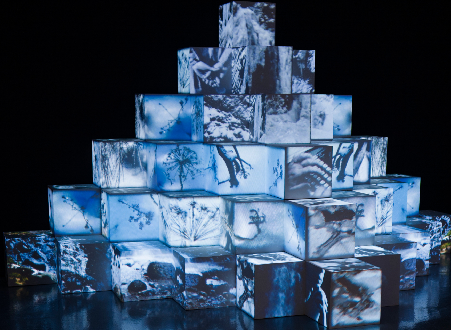
Souche , Anne-Sophie Emard, view of installation

Video sculpture (video mapping) 180 cm x 330 cm x 180 cm